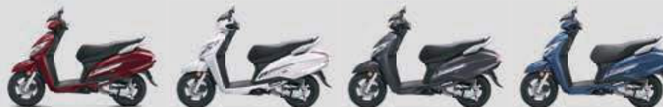
Rebel Red Metallic Pearl Precious White Heavy Grey Metallic Midnight Blue Metallic

*The technical specifications and design of the vehicle may vary according to the requirements and conditions without any notice • *Distance to empty, real time and average mileage readings may vary as per variant and riding conditions • Activa 125 meets Bharat Stage VI norms • Product shown in the picture may vary from actual product available in the market • Accessories shown in the picture are not part of standard equipment • The technical specifications mentioned are for Deluxe variant • ^Mileage has increased by 13% for Activa 125 BS-VI Deluxe variant as compared to the Activa 125 BS-IV Deluxe variant • All features and colours may not be part of all variants • **Conditions apply